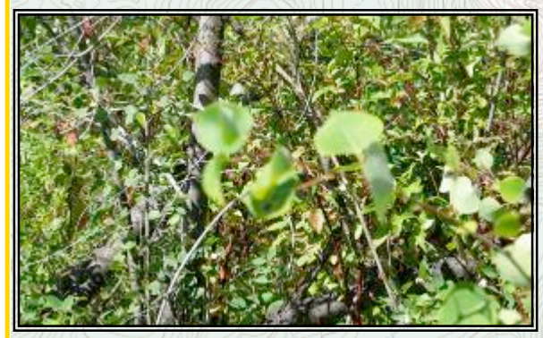
Searching can mean walking through almost impenetrable brush